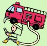
Educational Talks & Special Visitors