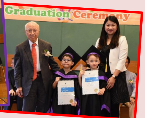
70th Hong Kong Schools Speech Festival (English Solo Verse Speaking Section)-Merit