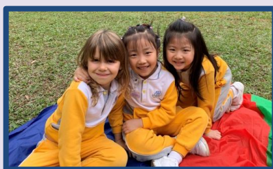
Visiting the Belcher Bay Park