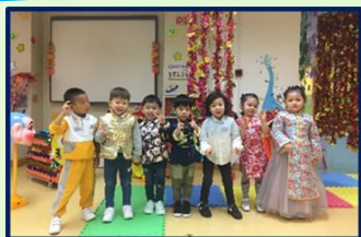
Celebrating Special Occasions & Festivals