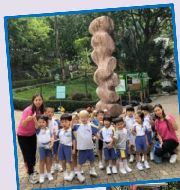
Visiting the Hong Kong Park