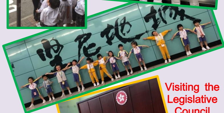
Visiting the Legislative Council