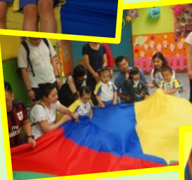
Parent-child Games Day