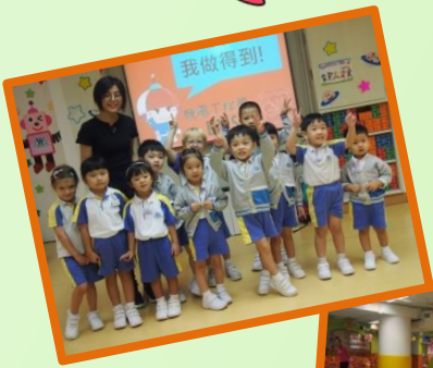
Mandarin Rhyme Competition