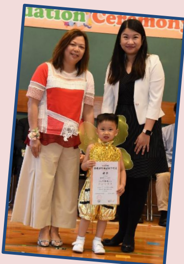
GAPSK Mandarin Proficiency Test- Outstanding Award