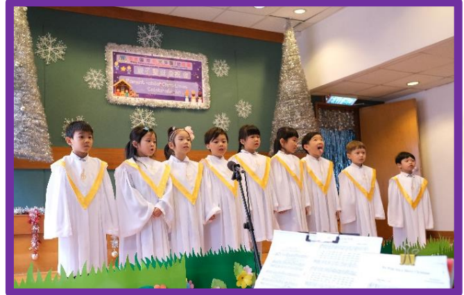
Witty Kids Choir