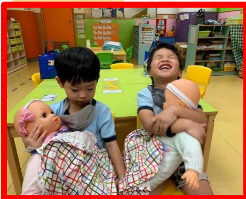
Awana - Puggles